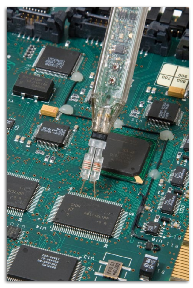
The Swivel Tip adapter can be adjusted to probe test points ranging from 0 to .300" apart with Z-Axis compliance.