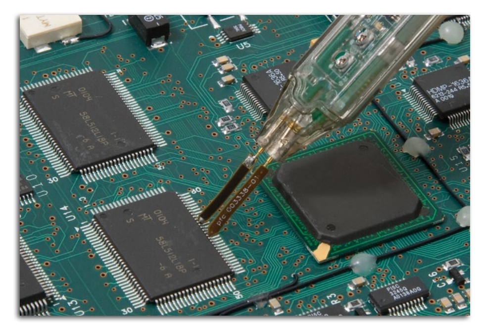
The IC leads with a compensation resistor provide excellent signal fidelity when probing pins of an IC. One side of each blade is insulated to prevent shorting the signal to the adjacent pin.